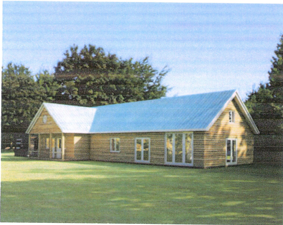
Aldworth Village Hall