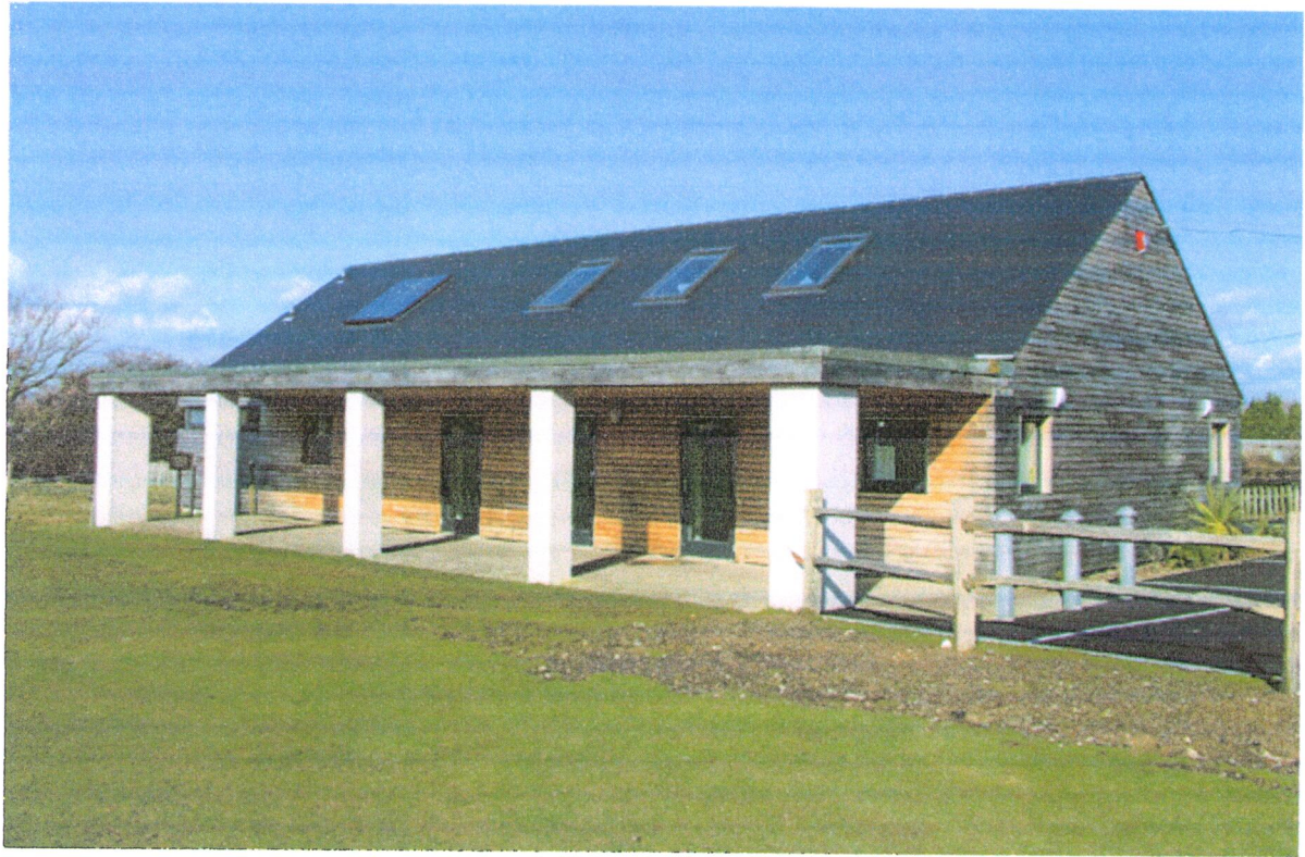
Cherhill Village Hall